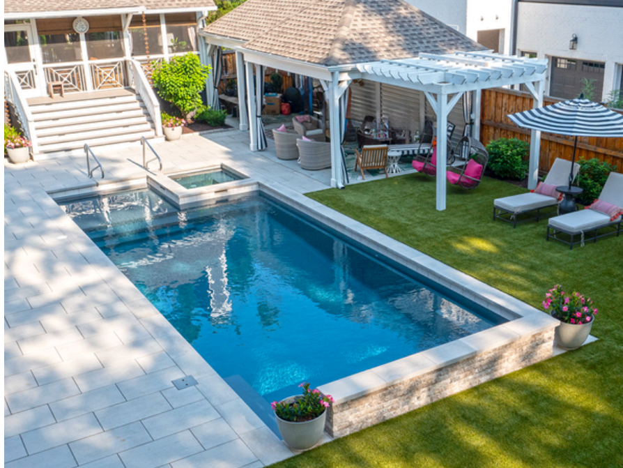
Leisure Pools | Fiberglass | Model: The Ultimate | Color: Graphite Gray

Every backyard has opportunities and constraints.