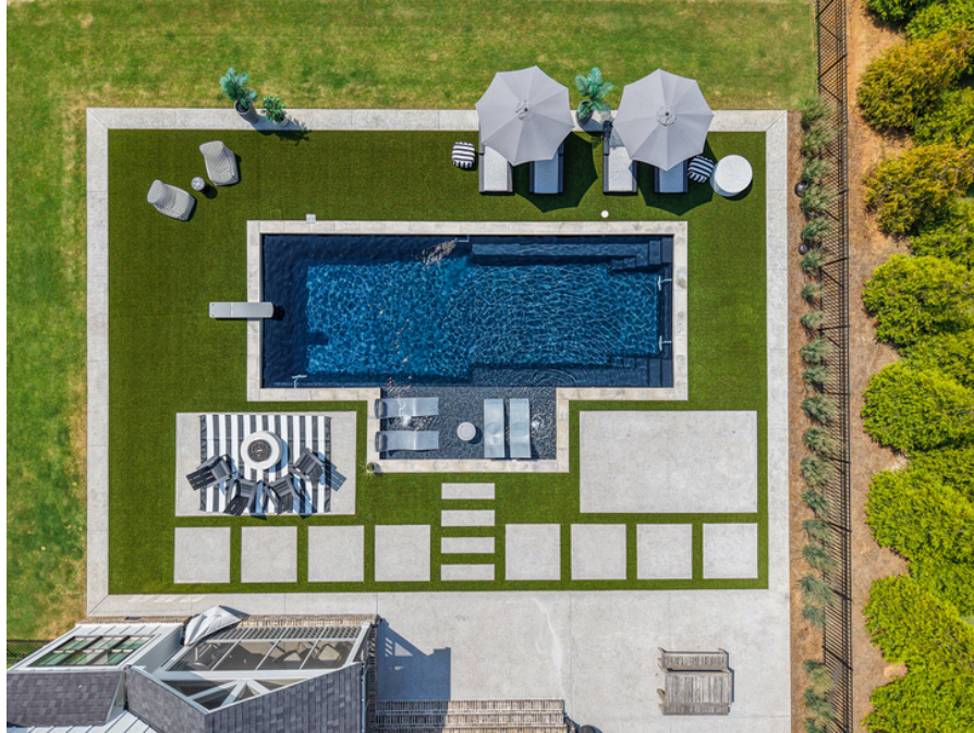
Leisure Pools | Fiberglass | Model: The Infinity | Color: Ebony Blue

Clarifying your top priorities helps guide every design decision.