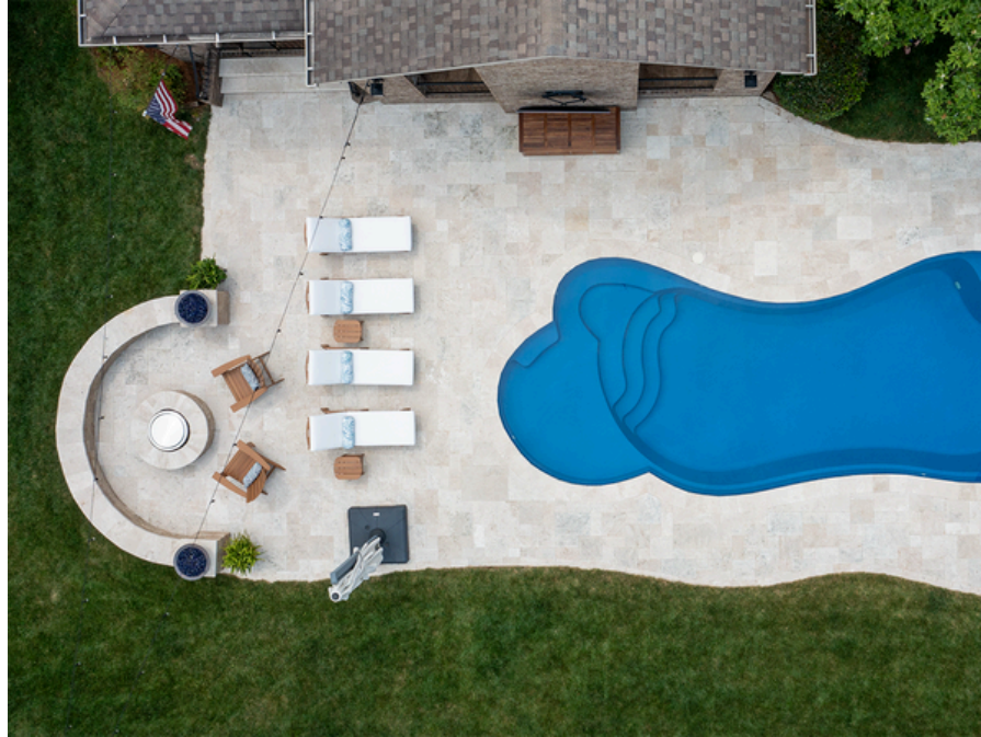
Leisure Pools | Fiberglass | Model: The Eclipse | Color: Sapphire Blue

Comfortable outdoor spaces extend how long and how often you use your backyard.