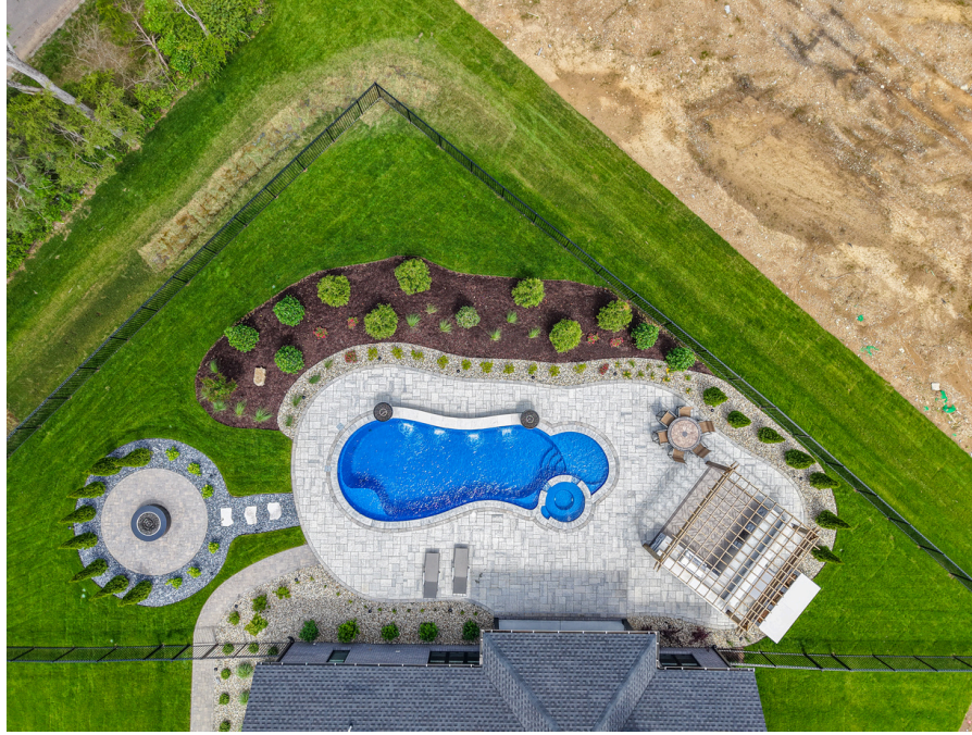
Leisure Pools | Fiberglass | Model: The Allure | Color: Sapphire Blue