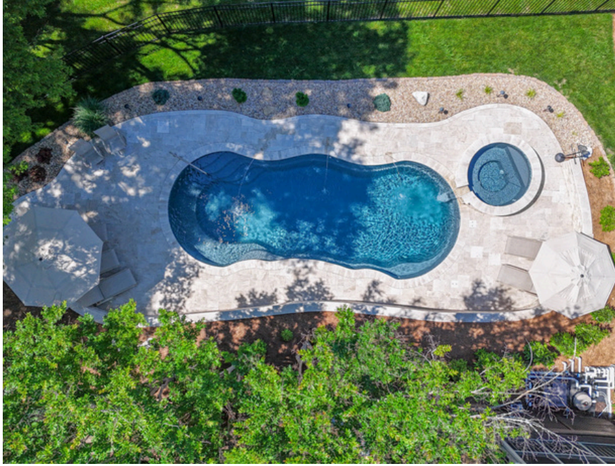
Leisure Pools | Fiberglass | Model: The Riviera | Color: Graphite Gray Leisure Pools | Fiberglass | Model: The Calvi Spa | Color: Graphite Gray

A beautiful backyard should fit your lifestyle, not add stress.