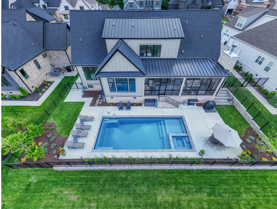
Leisure Pools | Fiberglass | Model: The Ultimate | Color: Silver Gray

Before moving forward, step back and look at the big picture.