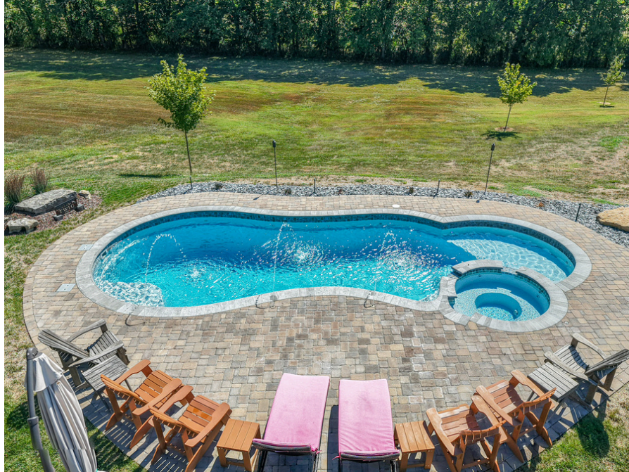
Leisure Pools | Fiberglass | Model: The Allure | Color: Silver Gray