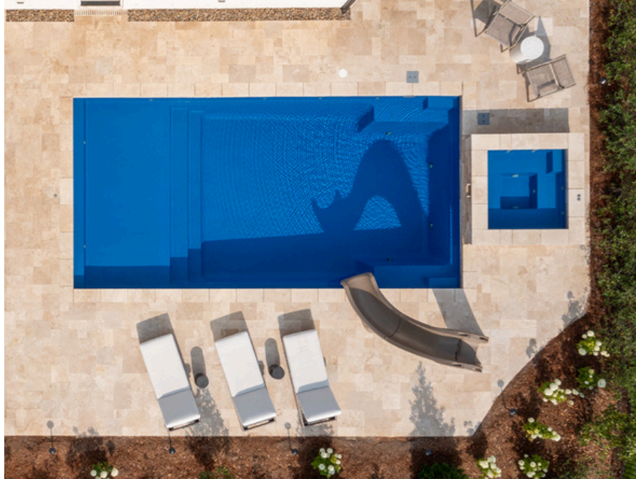
Leisure Pools | Fiberglass | Model: The Pinnacle | Color: Sapphire Blue Leisure Pools | Fiberglass | Model: The Amalfi Spa | Color: Sapphire Blue

A clear budget allows for smarter design choices.