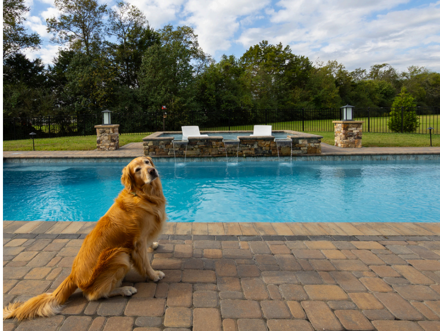
Leisure Pools | Fiberglass | Model: The Supreme | Color: Silver Gray Leisure Pools | Fiberglass | Model: The Quartz Tanning Shelf | Color: Silver Gray

Designing with kids and pets in mind improves safety and usability.