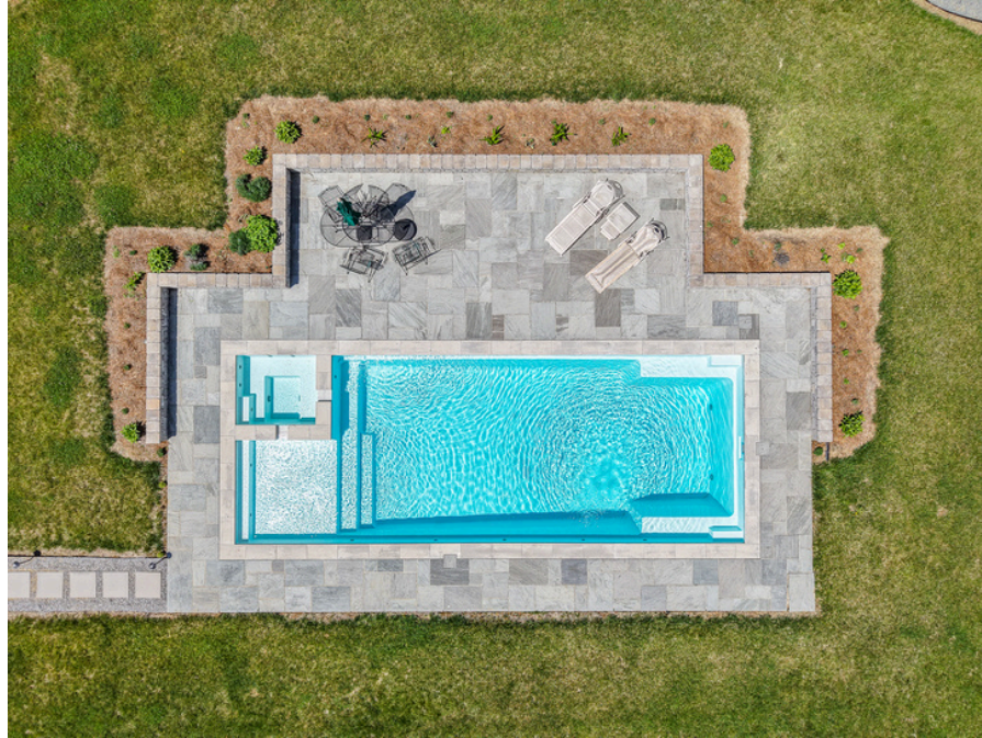
Leisure Pools | Fiberglass | Model: The Ultimate | Color: Shimmer Sky

Your backyard should complement your home and reflect your personality.